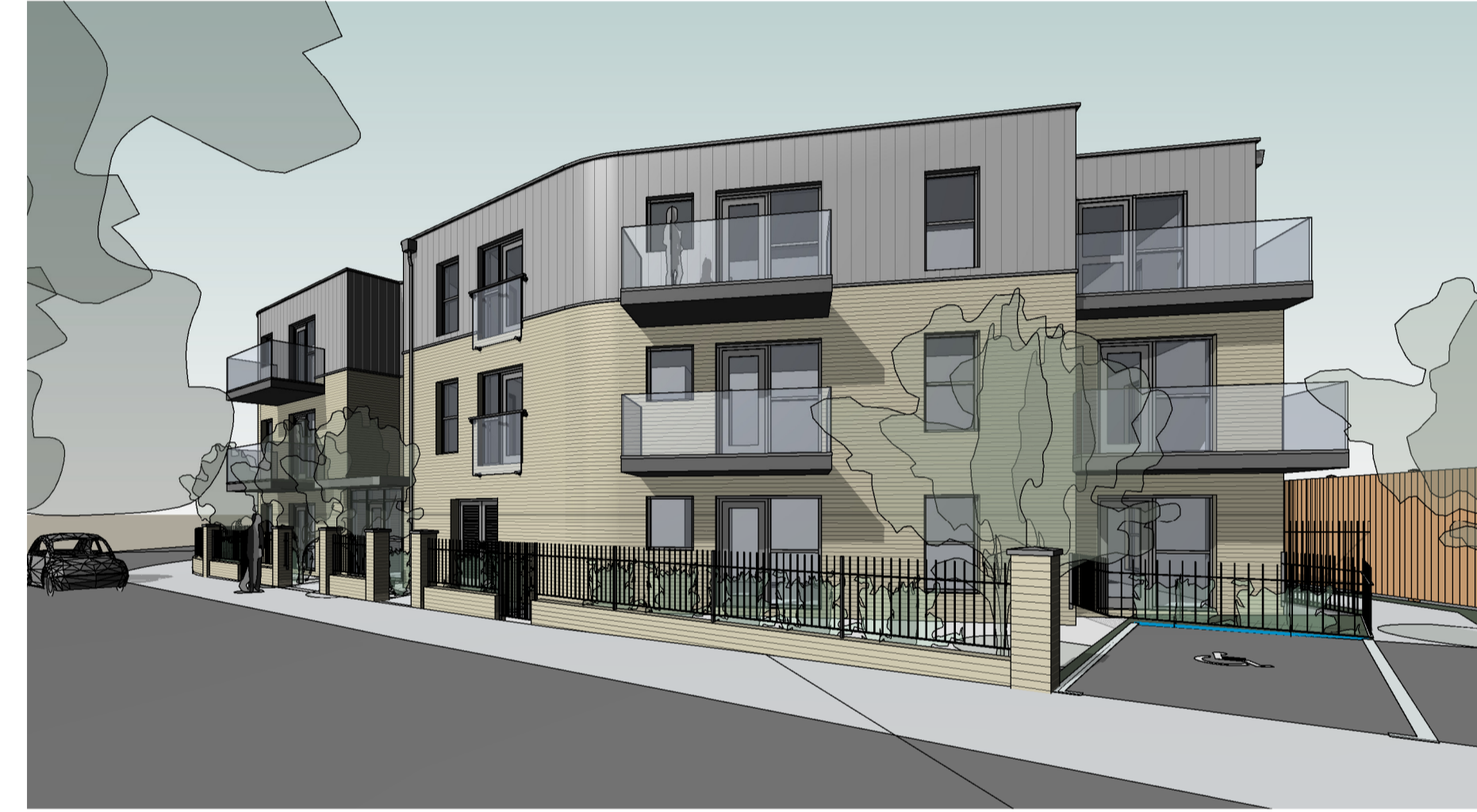
7 3D- North East