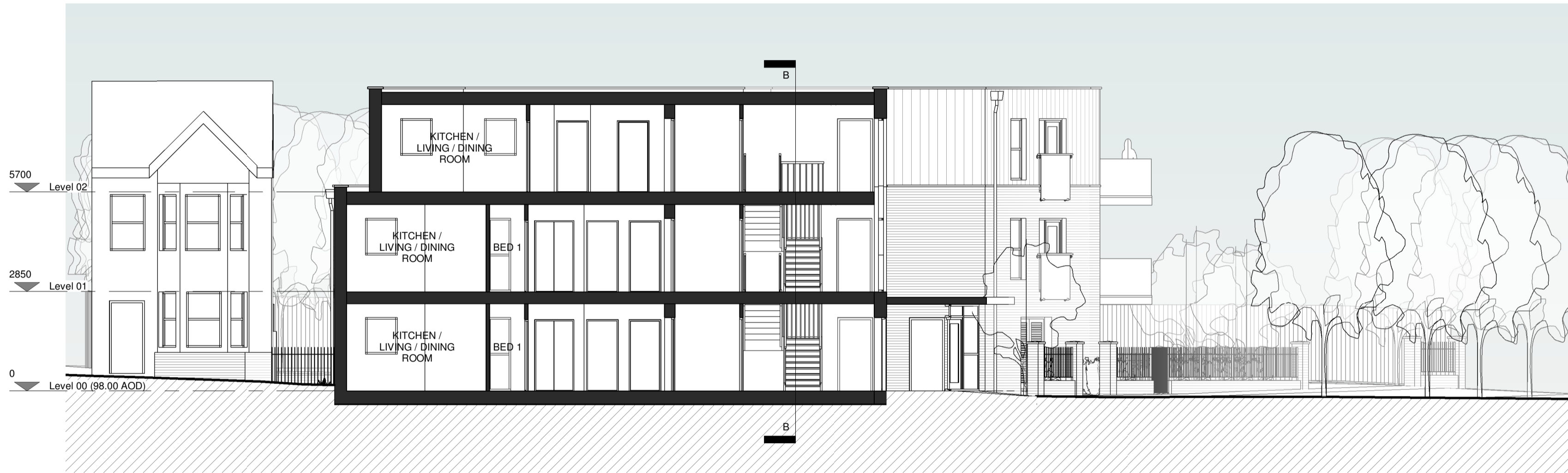
1 GA Section AA

Instructions Responsibility is not accepted for values obtained in scaling from this drawing Construction information should be taken from written dimensions only Inconsistencies should be reported to the legal owner immediately