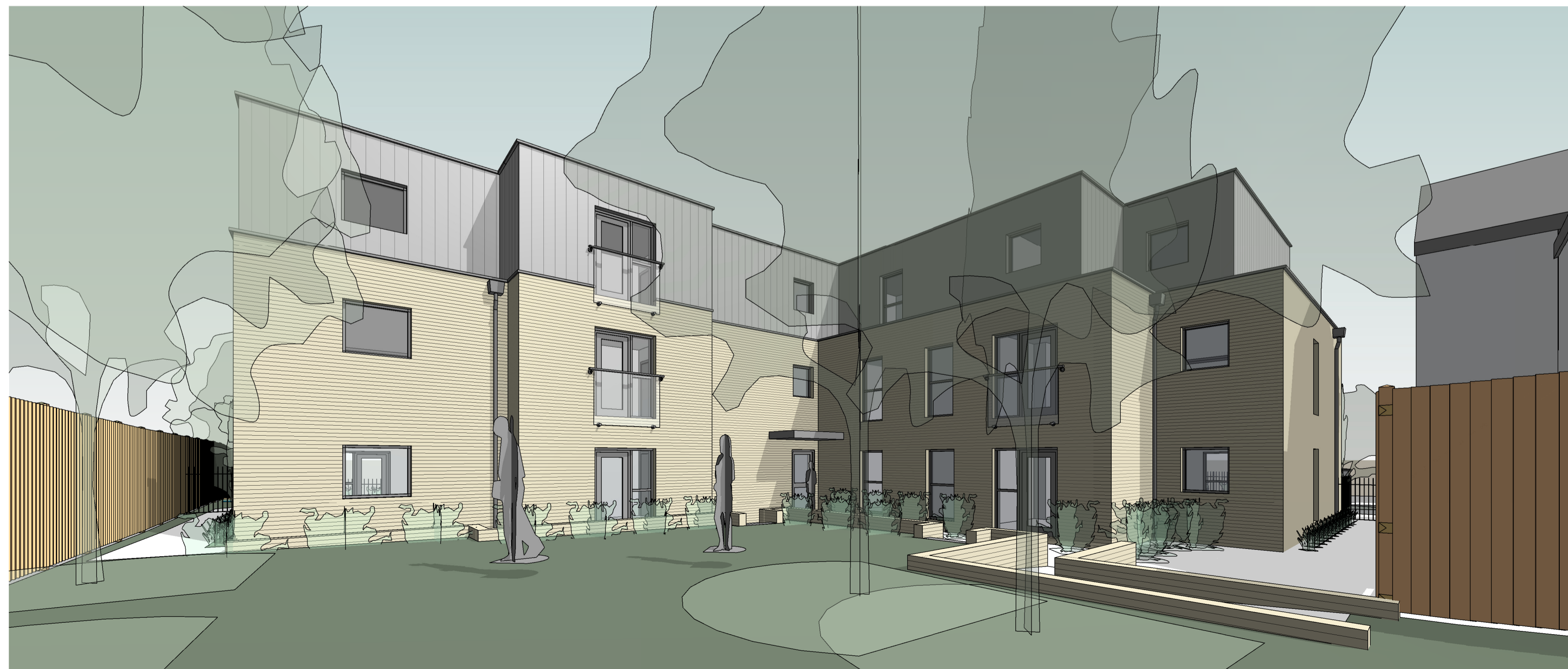
6 3D - South